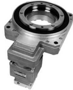
ABLE with Rotary Stage