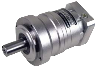
ABLE Inline Series