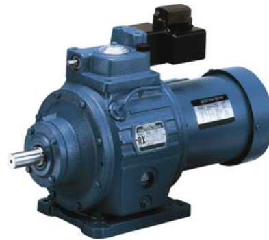
Ringcone Motor Assembly