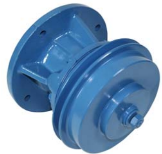
Circulute Pulley Style