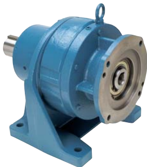
Circulute Cycloidal Reducer