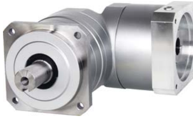
ABLE Right Angle Series