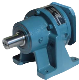
Circulute with Servo Input