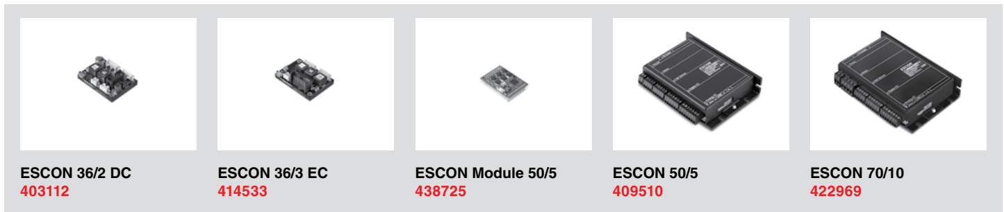
ESCON 36/2 DC 403112