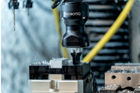
Force Copilot sold separately

ADAPT THE HAND-E TO YOUR PARTS WITH ACCESSORIES OR CUSTOM FINGERTIPS