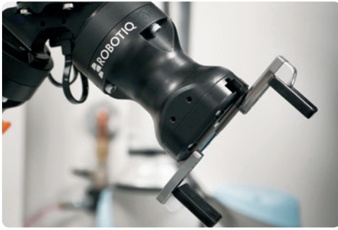
Extenders sold separately