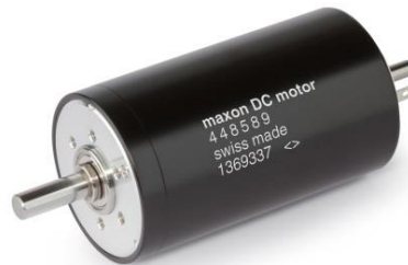
Fig. 4: Two maxon RE 40 motors are used in the climbing robot together with planetary gearheads. © 2014 maxon motor ag