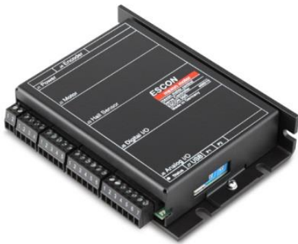
Fig. 3: The maxon ESCON 50/5 servo controller.