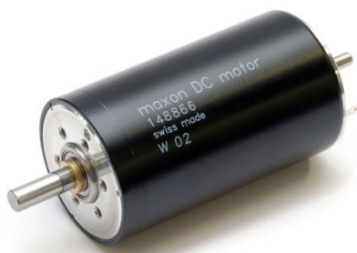
Figure 3: The 150 W maxon RE 40 drives the seawater manipulator.