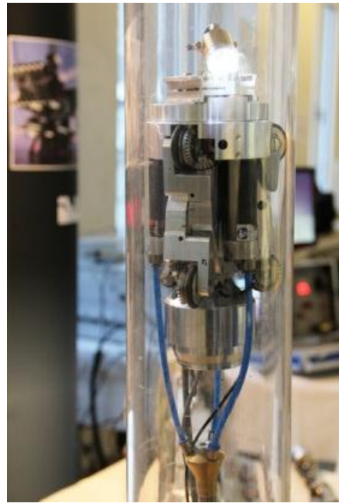
Figure 2: Plexiglas pipes provide a good view of the movement and functional principle of the manipulators.

Author: Anja Schütz, Editor, maxon motor ag Application note: 3632 signs, 682 words, 6 figures