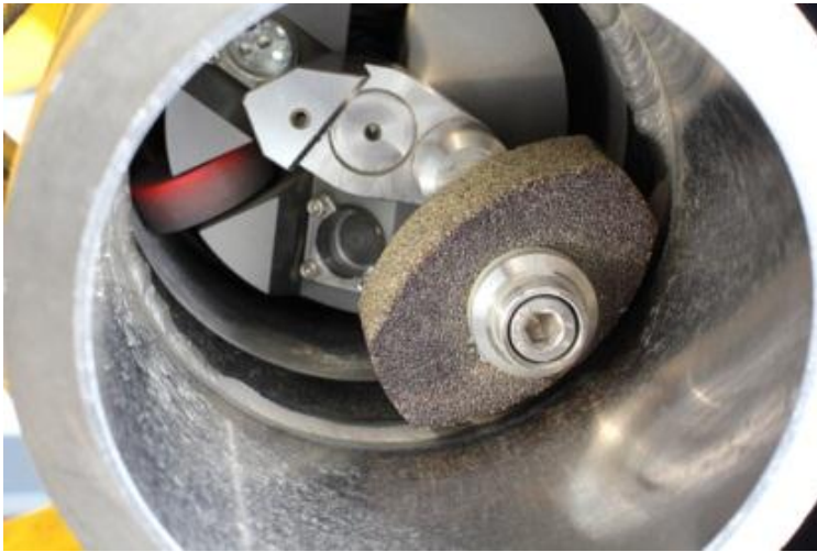
Figure 5: Ibass also offers high-performance grinding manipulators for smoothing weld seam roots in pipes – regardless of the degree of burr.