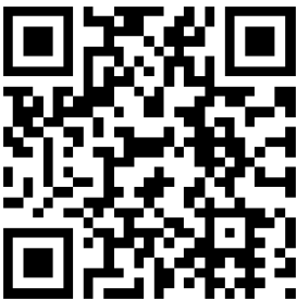
Video of the "seawater manipulator"