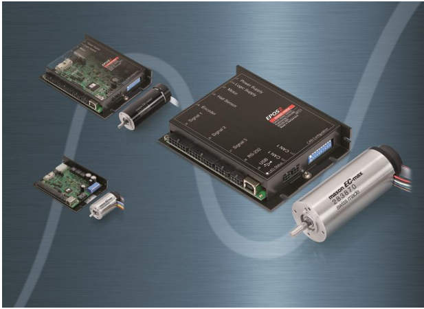
Figure 3: The EPOS2, brushless DC motor controllers are easy to install and implement using one of several major interfaces, plus are compact enough to keep the system's footprint small.