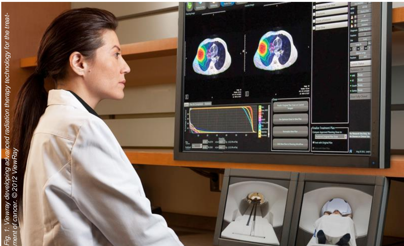
Fig. 1: ViewRay developing advanced radiation therapy technology for the treatment of cancer.