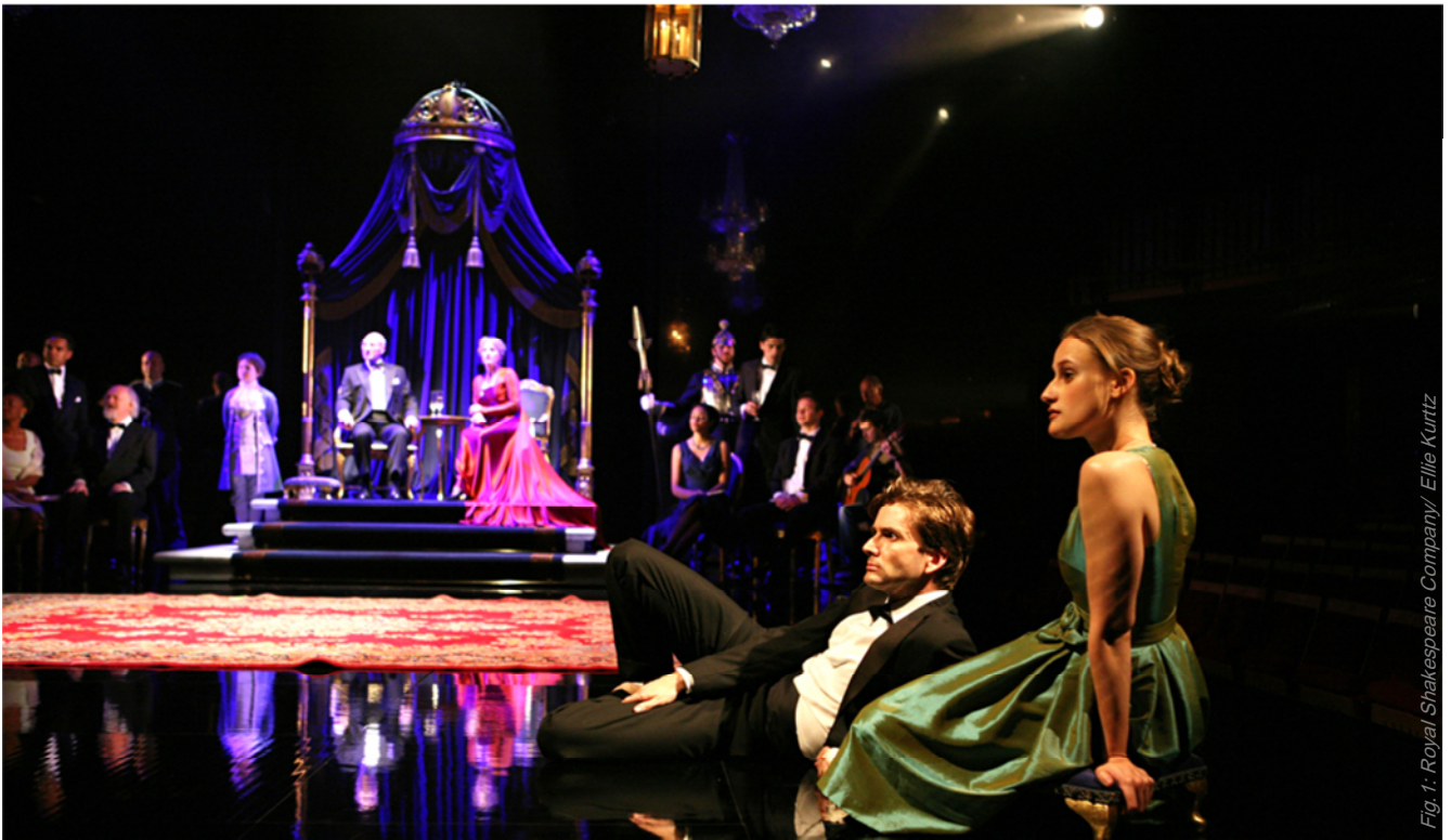
Fig. 1: Royal Shakespeare Company/ Elle Kurtz