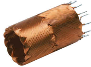
Figure 4: Self-supporting ironless winding type maxon