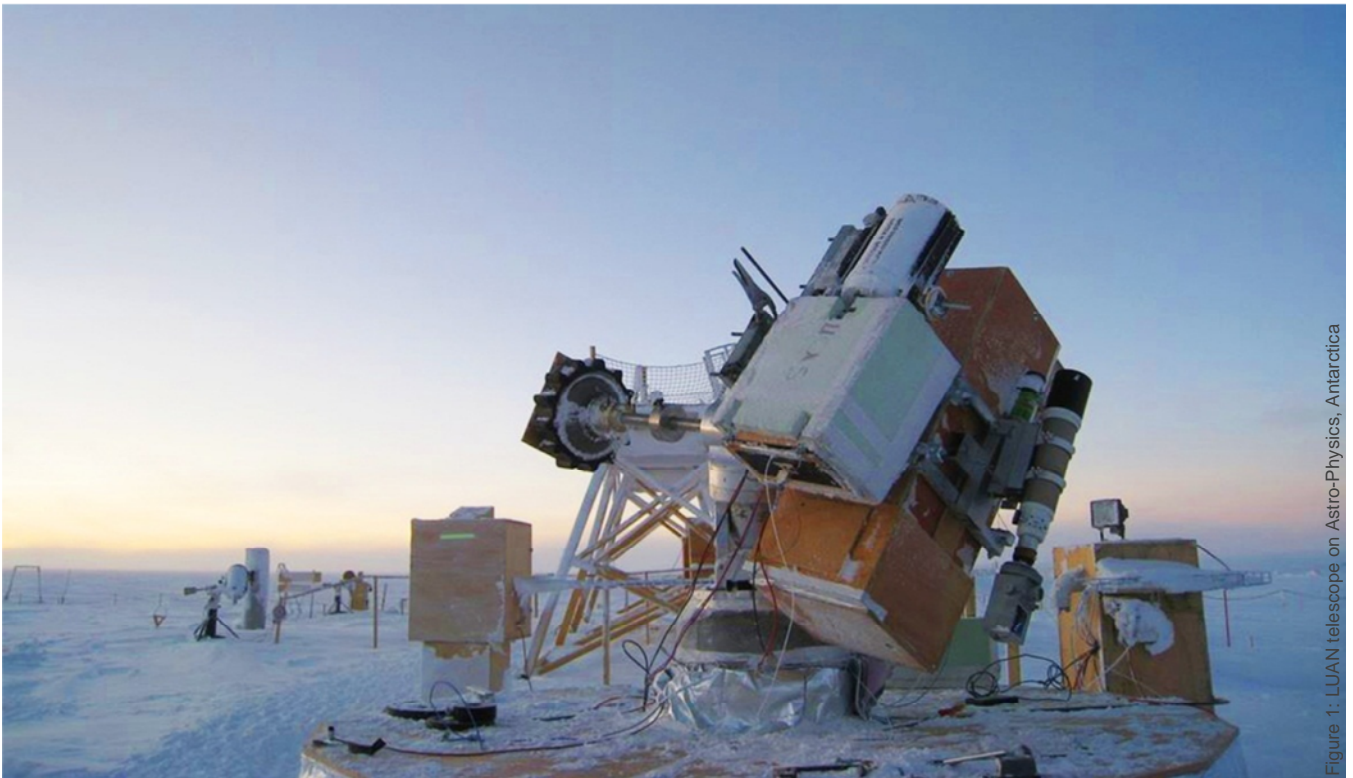
Figure 1: LUAN telescope on Astro-Physics, Antarctica