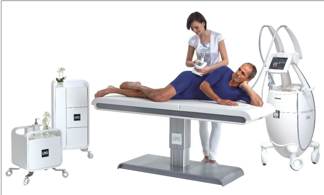
During the kneading-rolling massage the patient wears a suit, designed to make the therapy more effective.

Today some 200,000 people in 110 countries undergo treatment with LPG technology every day. There are two versions of the treatment. The original version, Lipomassage, uses the kneading-rolling principle. The therapist massages the customer using a hand-held device, which is equipped with two rollers controlled independently of each other. They are driven by brushed DC motors. The size of the hand-held device depends on the part of the body to be treated. During the procedure the patient also wears a whole-body suit, designed to support the effect of the massage.