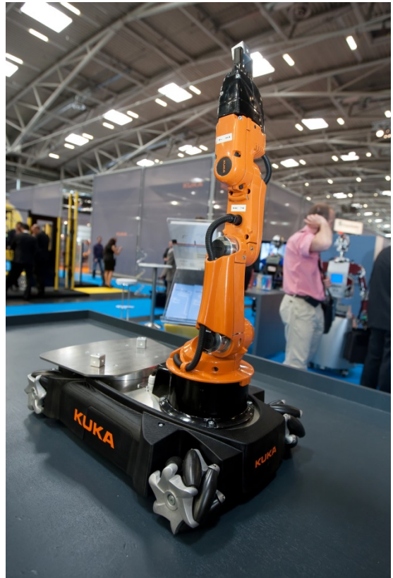
Figure 2: The robot's control software is a Linux-based open-source system equipped with various open interfaces.

Author: Anja Schütz, Redaktorin maxon motor ag Application story: 4071 characters, 642 words, 4 figures