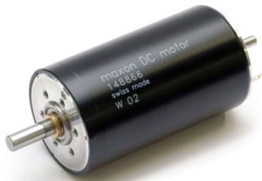
Fig. 3: Ten DC RE 40 maxon motors per exoskeleton ensure smooth movements.

Application note: 6025 characters, 1014 words, 4 figures