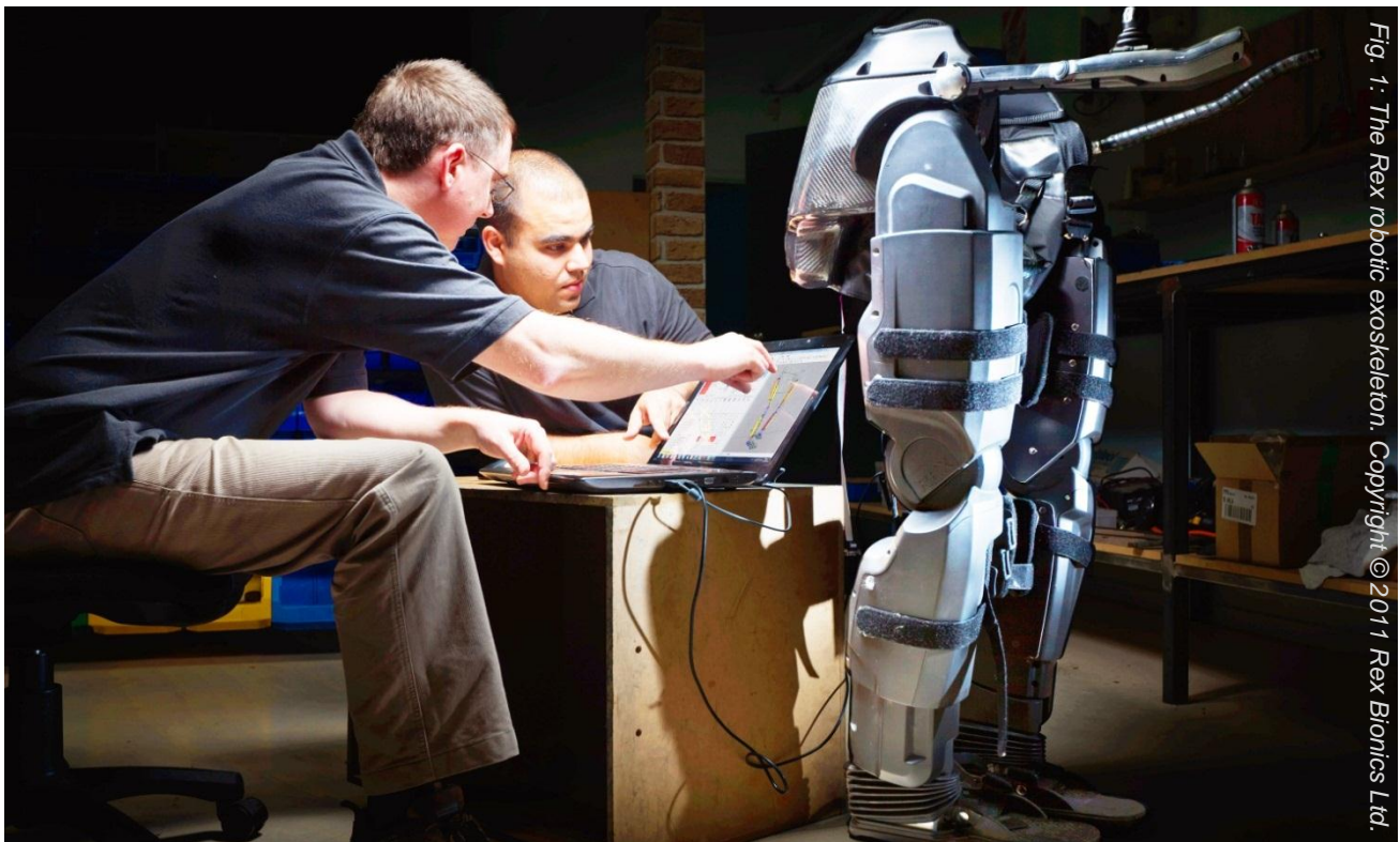
Fig. 1: The Rex robotic exoskeleton.