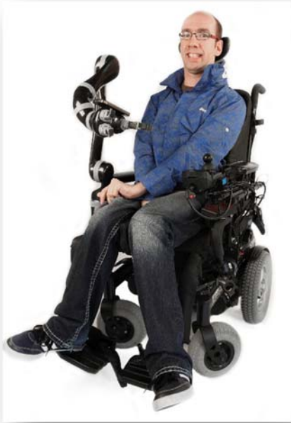
The Jaco2 easily mounts to a wheelchair and stays out of the way.

The company's Jaco2 Robotic Arm has benefited from the company's prior designs and forward thinking. Because of available technologies, the robotic arm provides a lightweight, quiet, and easily controlled device to the service industry. The Jaco2 robotic arm moves around six degrees of freedom through the use of six flat motors designed and manufactured by maxon precision motors (Fall River, MA). The arm was designed using six joints from a shoulder-type joint through to a functional wrist joint. The robot can manipulate a maximum payload of 1.5 kg at full extension, as well as a 2.5 kg payload at a mid-range extension. Both of these payloads are adequate for the needs of most disabled people in the process of living a normal life. The robotic arm device itself weighs only 5.3 kg, which was a very important specification for it to mount to a wheelchair without tipping it over. To maintain such a light weight, the company incorporated the lightweight and efficient flat motor series manufactured by maxon.