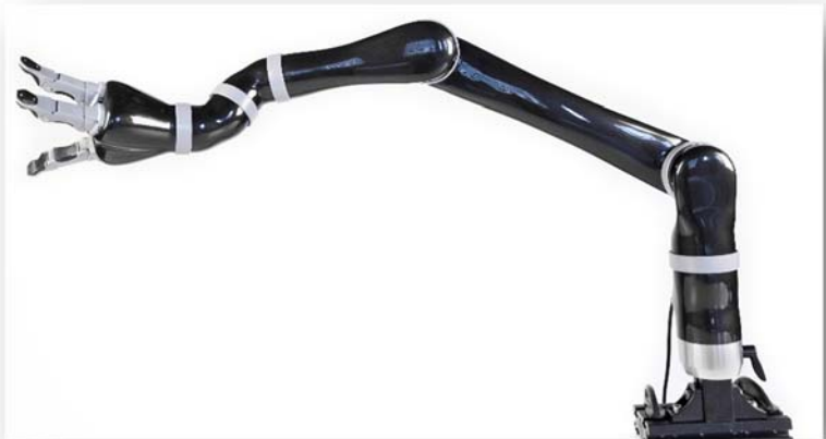
The Jaco2 fully extended and at rest.

The second three joints in the Jaco2 arm are also EC 45 flat motors, but are 30 Watt versions. Again, they were chosen to help keep heat dissipation at a minimum, since the motors were mounted inside the arm itself. Further, the flat motors were necessary because of the compact space allocated to the robot joints. The motor efficiencies offered by maxon motors were a critical point in selecting the EC series for the application. Plus, according to one member of the engineering team, maxon was open to slight customizations, which allowed the team to fit the motors to the application perfectly. Through the use of slip rings that were designed and manufactured in-house, each axis on the arm has infinite rotational capabilities. The arm incorporates Harmonic Drive® gears translating to a 1:136 ratio for the large actuators in joints one and three, a 1:160 ratio for the large actuator in joint two, and 1:110 ratio for the small actuators located in joints four, five and six.