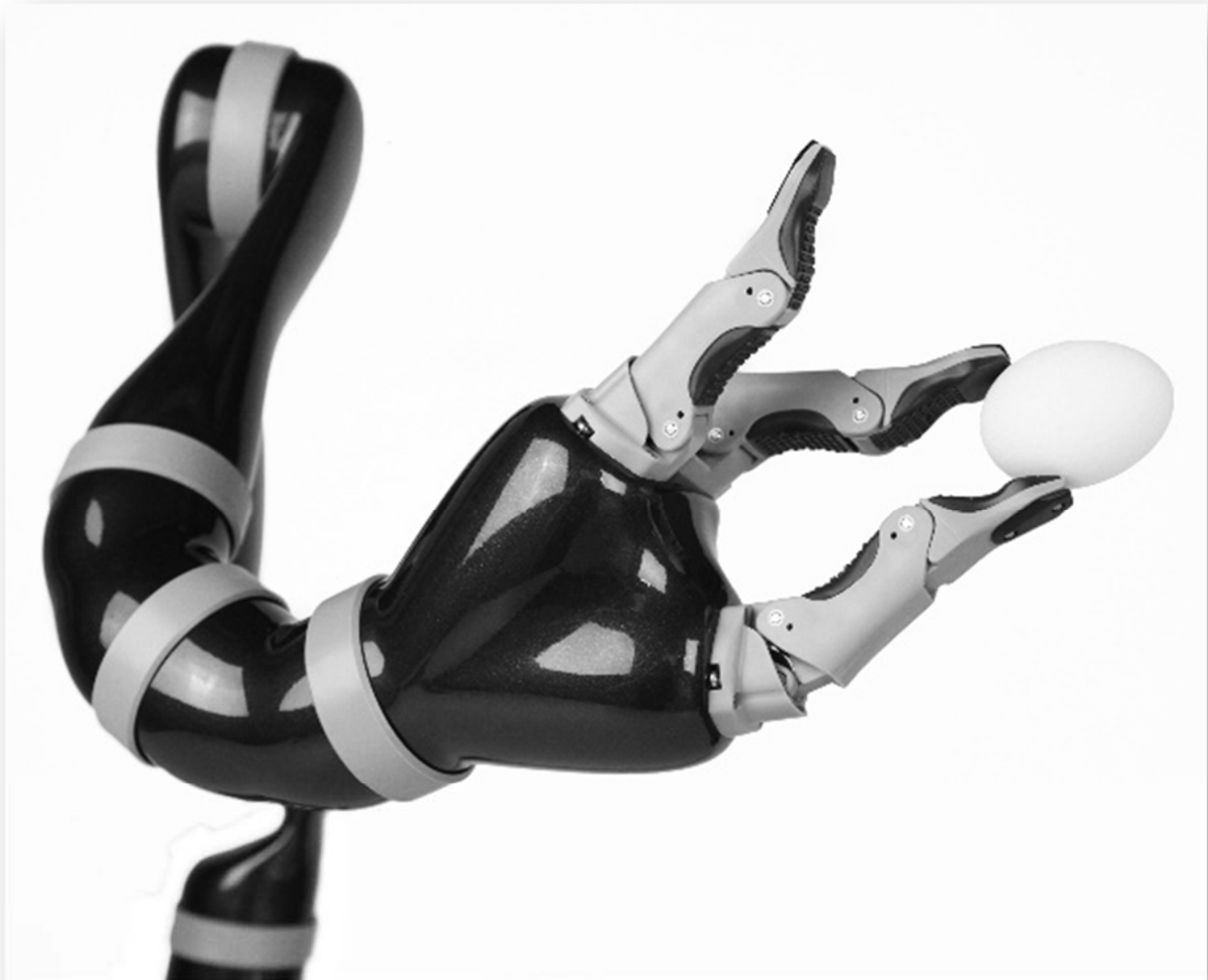
The Jaco2 service robot was designed and engineered by Kinova Robotics. Here, the robot shows well it handles fragile household items.

Service robots being designed for the disabled must be reliable, safe, and easy to use. Having the right motion system components is essential for these highly specific applications.