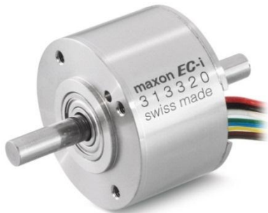
Figure 4: The brushless maxon EC-i 40 motor has an output power of 50 W.