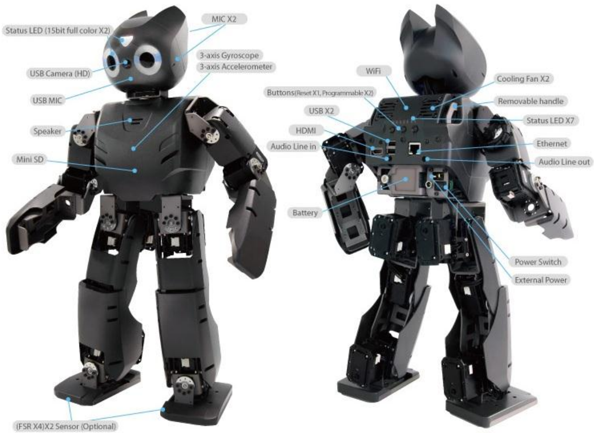
Figure 3: The humanoid Darwin-OP robot in detail.