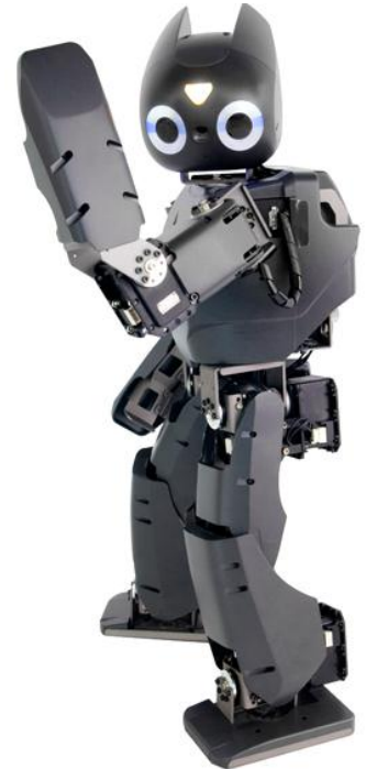
Figure 2: There are 20 RE-max motors of maxon in the DARwIn-OP.

Telephone +82-70-8671-2609 Fax +82-70-8230-1336 Web www.robotis.com