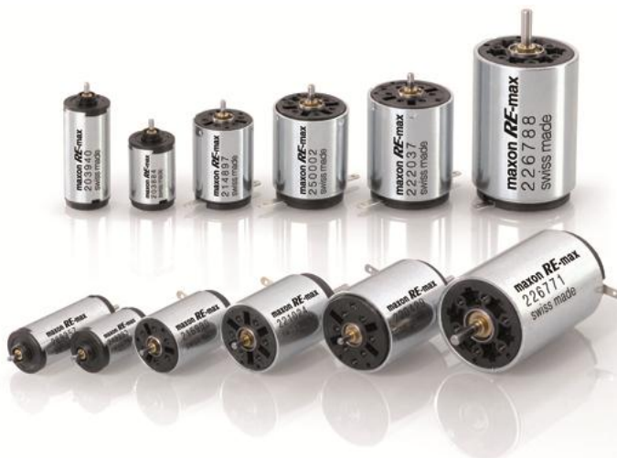
Figure 4: maxon RE-max is the economical RE line. Thanks to neodymium magnets, the drives are very powerful.