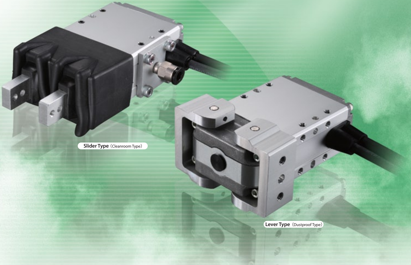
Slider Type (Cleanroom Type)