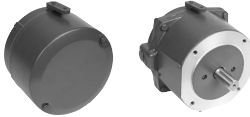
Selection Chart – AC Motor Brakes