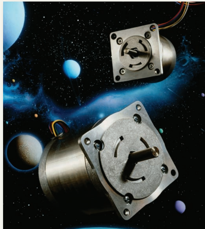
These motors withstand space-related environments, which include vacuum (10-8 to 10-12 torr), deep space cryogenic (20° Kelvin), thermal shock (sun at +200°C to shade at -200°C in one to two seconds), launch vibration, ionized particles, and radiation.

The bearings are installed on the rotor shaft, and the preload wave springs and retainer springs are inserted. The motor is then assembled and the end bells are mechanically attached to the motor housing. The motor is then connected to a drive and tested for function. Static torque can be checked and dynamic torque-speed curves may be developed on the motor. Torque-speed curves require special measurement equipment. A