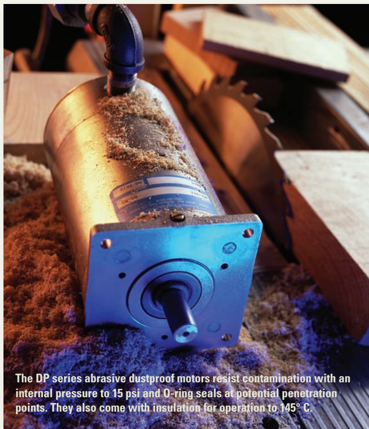
The DP series abrasive dustproof motors resist contamination with an internal pressure to 15 psi and O-ring seals at potential penetration points. They also come with insulation for operation to 145° C.