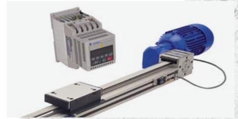
DLS Belt Driven System with Motor and Controller