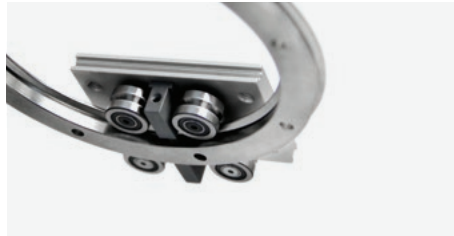
PRT2 Ring and Track System