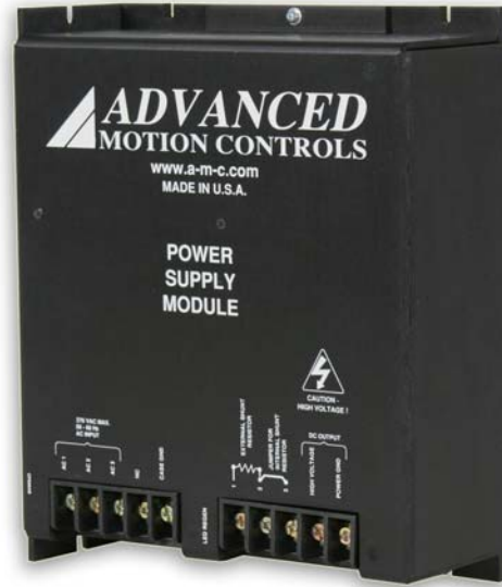
PS50A Series Power Supply