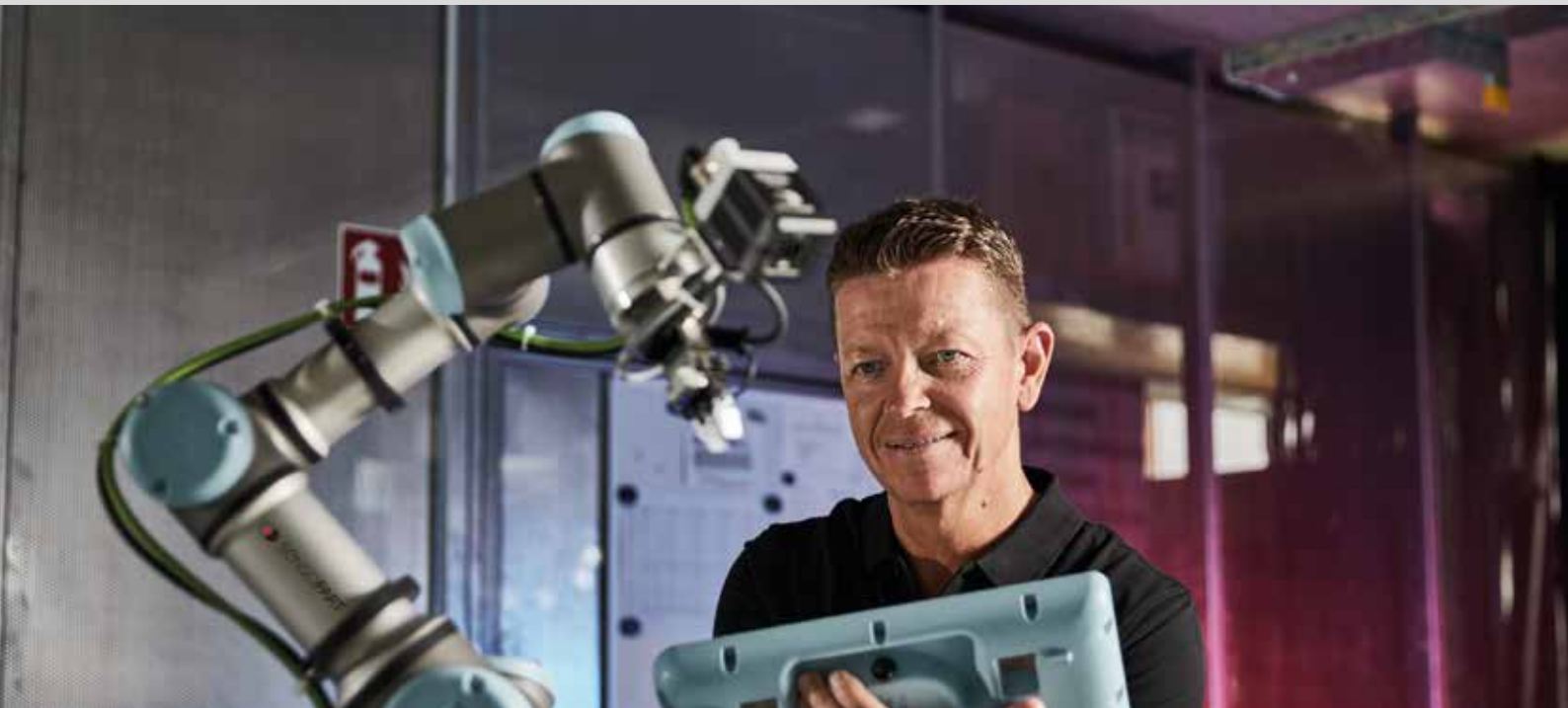
Easy setup of robotics applications using the operating panel

Tasks in the automation sector are becoming increasingly complex, and expectations of robots are also steadily climbing. SensoPart is therefore expanding its VISOR® series of vision sensors to include a robotics specialist. Thanks to a URCap software package, the new VISOR® Robotic can communicate directly with Universal Robot systems. This ensures particularly fast and easy configuration of automation tasks.