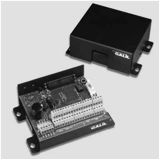
ICM-1460 Interconnect Module (shown with and without cover)

For applications requiring optoisolation, the ICM-1460 "OPTO" option provides 5–24 V optoisolation on all general inputs and outputs, home inputs, limits, and abort input.