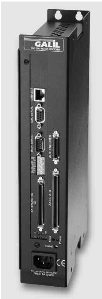
DMC-22x0 Stand-alone with Ethernet/RS232

Like all Galil controllers, the DMC-2xx0 controllers use a simple, English-like command language which makes them very easy to program. Galil's WSDK servo design software further simplifies system set-up with "one-button" servo tuning and real-time display of position and velocity information. Communication drivers are available for Linux and Windows operating systems.